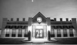
1050 Rymal Rd. E., Hamilton 905.388.4411

HAMILTON • ANCASTER • BURLINGTON BANQUET AND CONVENTION CENTRES