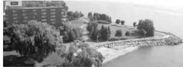
2020 Lakeshore Rd. Burlington on the Waterfront 905.631.6011